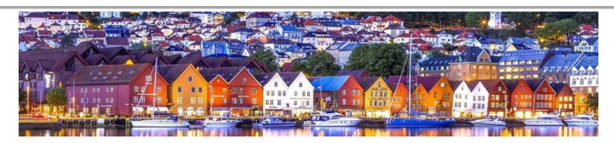
BERGEN · NORWAY 19-21 september 2019